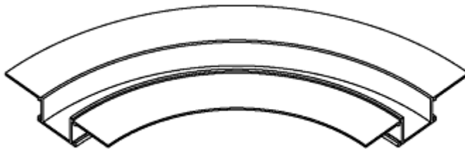
Curves - Inside / Outside

* Please indicate to what point on the trim the Radius is to.