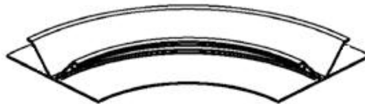
Curves - Inside/Outside

* Please indicate to what point on the trim the Radius is to.