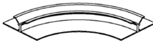
Curves - Inside/Outside

* Please indicate to what point on the trim the Radius is to.